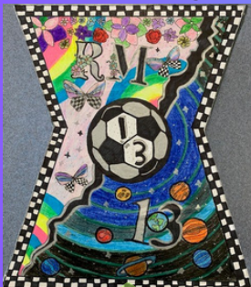
An amazing Room 13 Suggestion Box design here from Arshpreet.

In Room 13 we work hard, but play hard when we can. We have high expectations and work towards them. We celebrate successful behaviours with games of 2-ball soccer, hand hacky and other fitness related activities. Each term we celebrate positive behaviour with a movie afternoon. Who doesn't love popcorn and a movie? I love matching the curriculum to artistic and design related activities. You can see here some examples of this here.